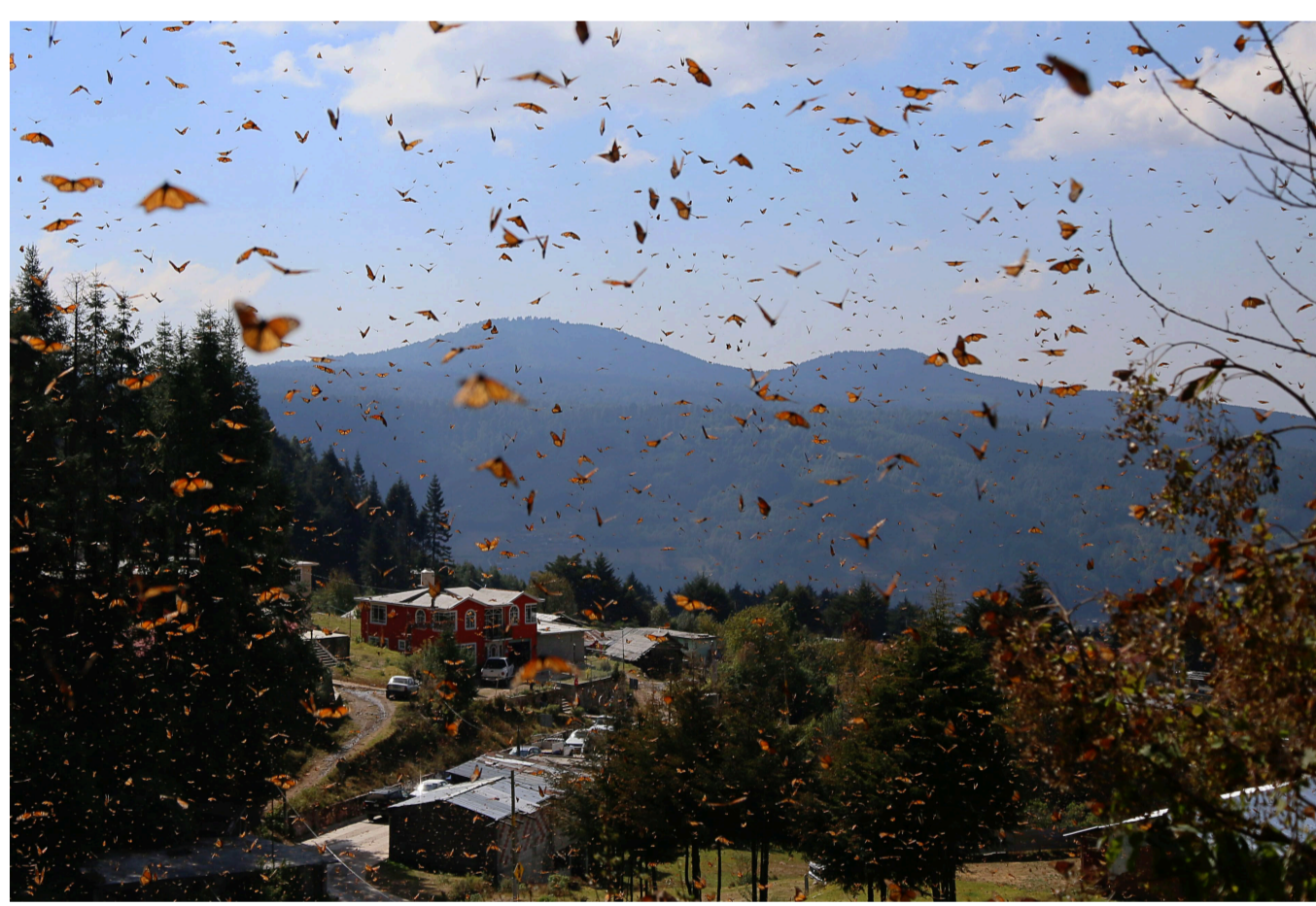
FLUTTER SPEED MEETS SHUTTER SPEED Monarch butterflies fill the air around on the mountaintops in the Monarch Butterfly Biosphere Reserve, a UNESCO World Heritage Site in Michoacán, Mexico.

The migratory monarch butterfly, a subspecies of the monarch butterfly, was recently added to the IUCN's Red List as an endangered species, due to pressures from habitat loss and climate change.